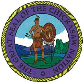
Bill Anoatubby Governor